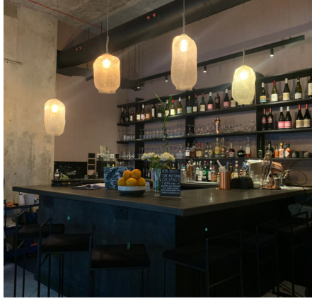
BAR & TERRACE